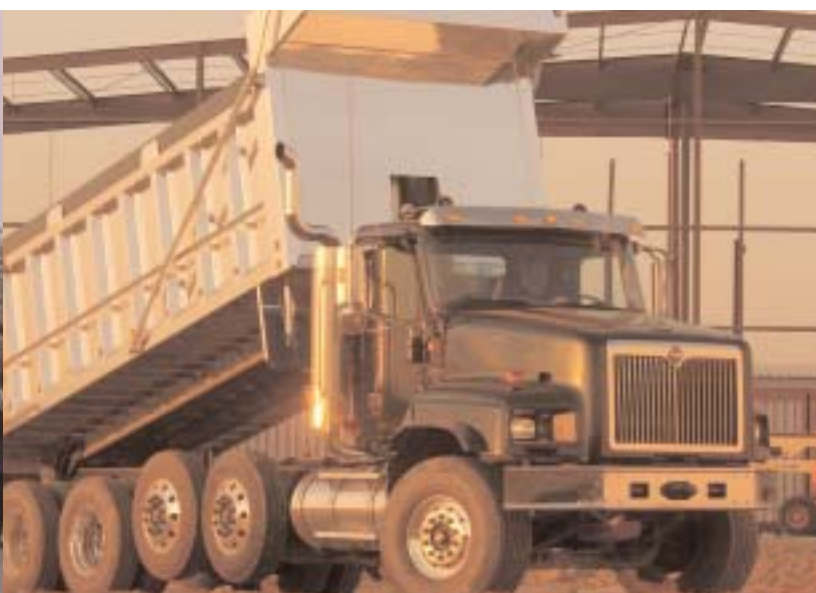
International 5600 i