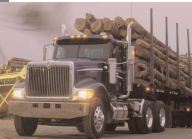
International 5900 i

Dump. Mixer. Refuse. Logger. Heavy-haul tractor. International 5000 i Series trucks are engineered, built and ready to thrive in severe service – much to the shared delight of owner, driver and maintainer.