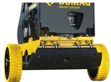
Simple and safe transport Transport wheels (optional)