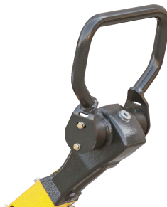
Precise and save to operate Comfortable control lever