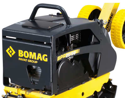
Robust and reliable Best component protection