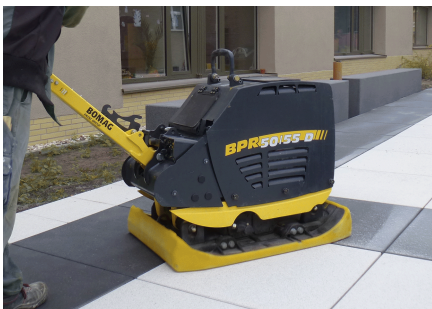
No breakage of paving stones