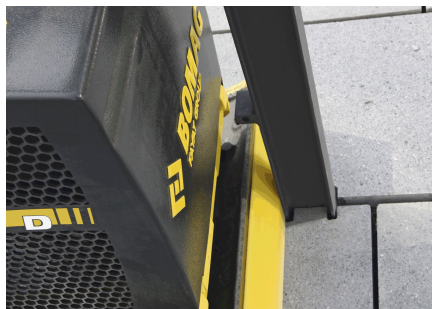
No damage to installations and borders