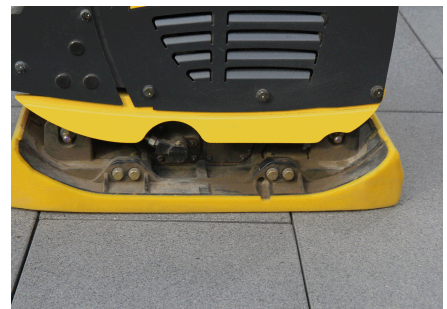
Large footprint for large formats