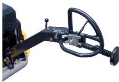
Precise and save to operate All function integrated in the steering rod head