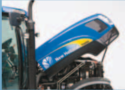
A one-piece, flip-up hood opens smoothly on a gas strut with open access to the engine, radiator, A/C condenser and filters.