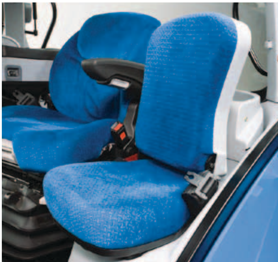
A comfortable, supportive, full-size instructor seat is a Horizon™ cab option.

cab also features heated electronic external mirrors and a speaker upgrade.