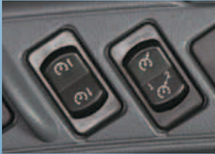
Push buttons for constant rpm and cruise control.