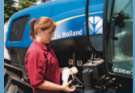
You can check the oil without raising the hood.