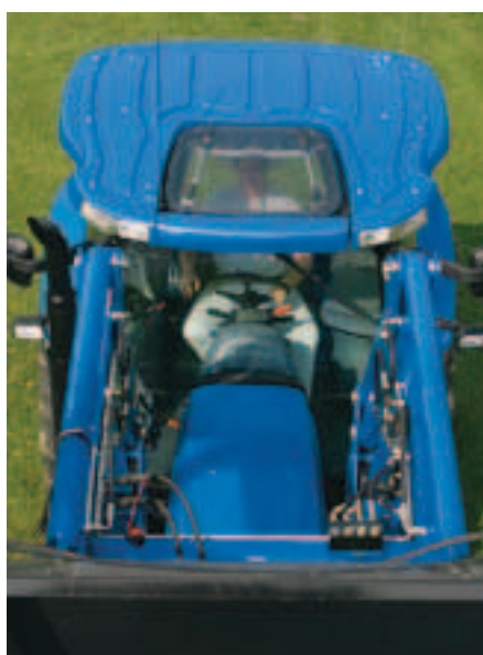
The Horizon™ cab features an optional high-visibility roof panel for an easy view to a raised loader bucket.

For the absolute smoothest ride over bumpy ground, choose the Comfort Ride™ Cab Suspension option available on Plus and Elite models. This simple mechanical system is always on. Two isolation “donuts” at the front corners of the cab and a swaybar and two shock absorbers at the rear isolate you from up-down motions and side-to-side swaying.