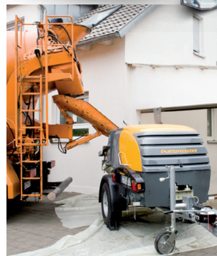
Truck mixers have ideal access to the large hopper.