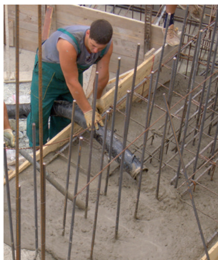
The P 718 conveys fine concrete up to a grain size of 32 mm, among other things.

This makes the P 718 an unbelievably versatile fine concrete pump that can be used when space is limited on the construction site.